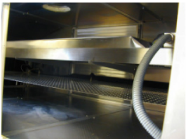
Lightpanel with 7 bulbs in U-shape-form Treatment are of 100 x 40 cm